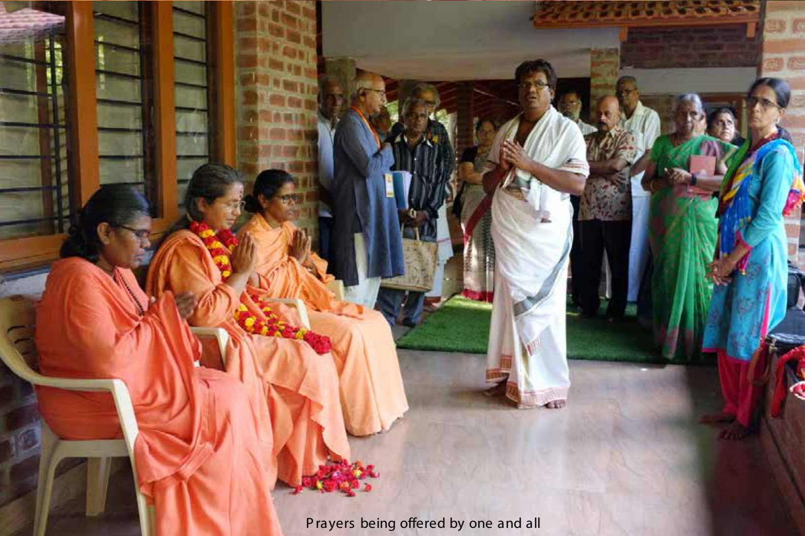
Prayers being offered by one and all