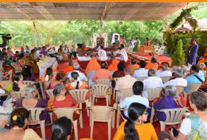
Rituals in the presence of Lord Vanalingesvara Temple