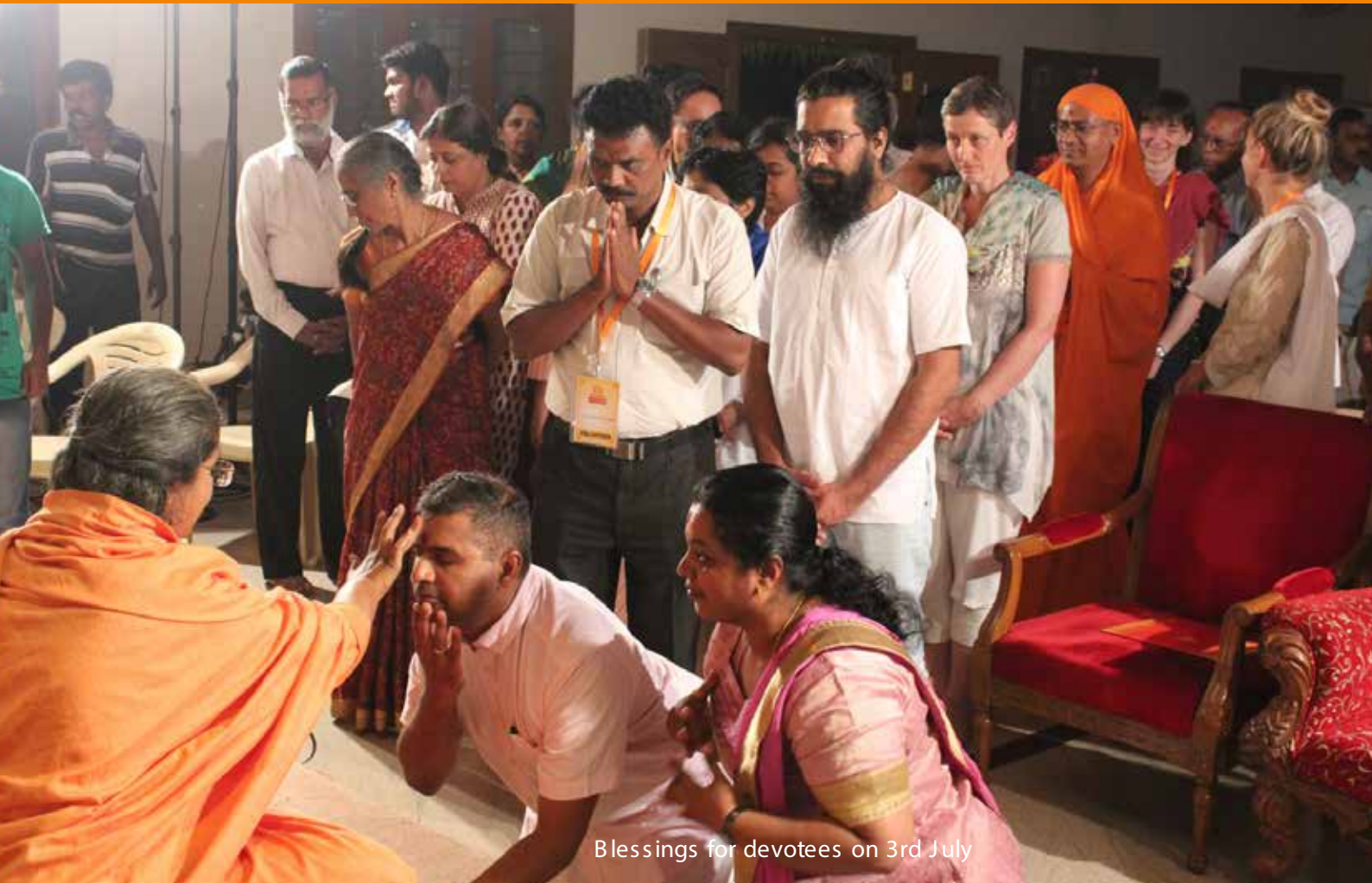
Blessings for devotees on 3rd July