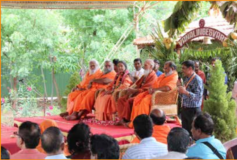
Purna Vidya Middle East represented