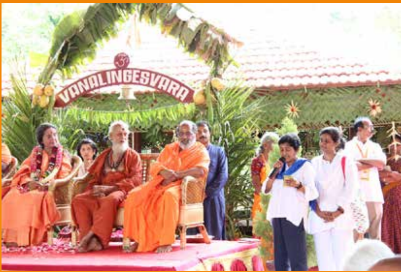
Purna Vidya South East Asia