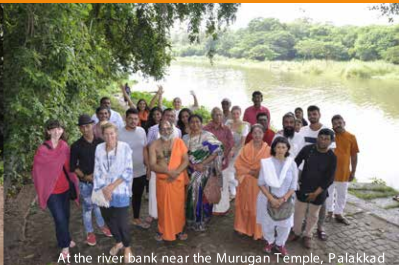
At the river bank near the Murugan Temple, Palakkad