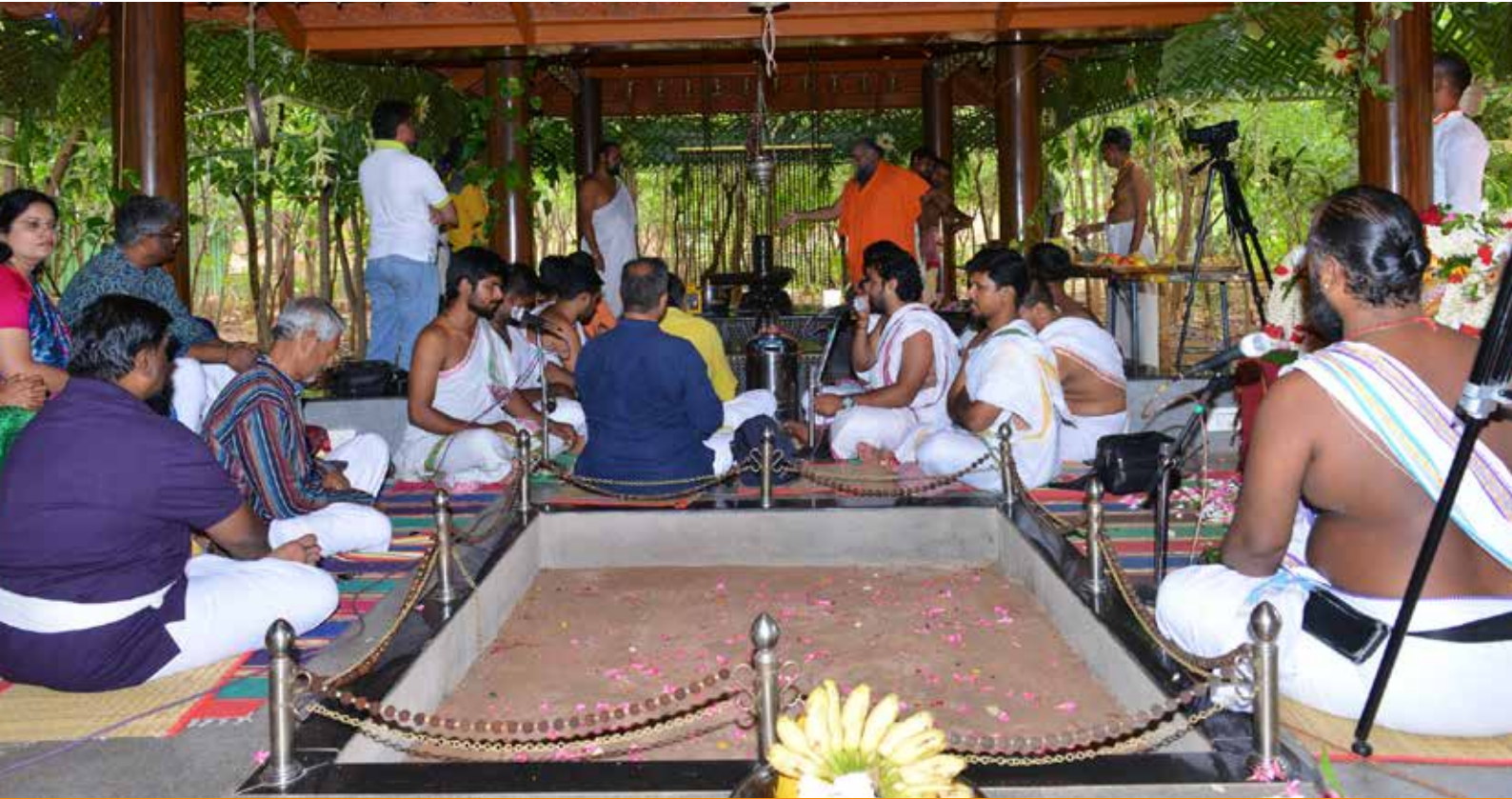
Maha-abhisekam to Lord Vanalingesvara