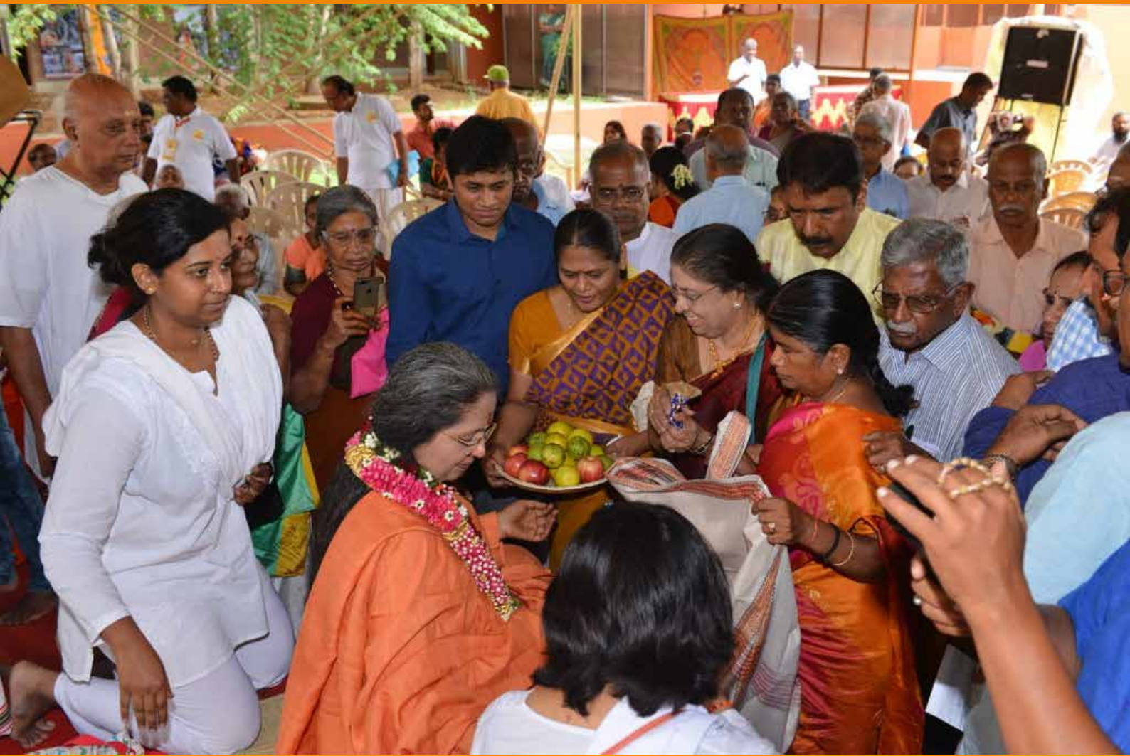
Ammaji blessing the devotees