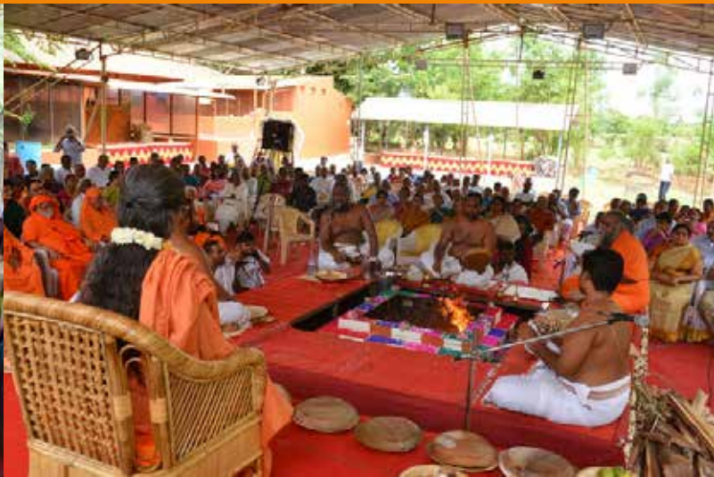
Ammaji with the fire ritual