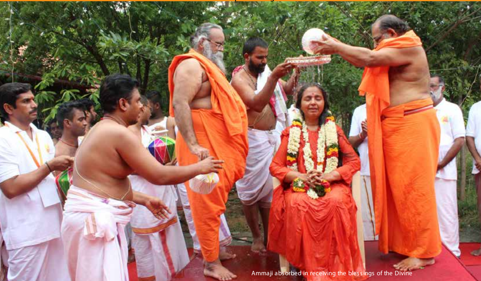
Ammaji absorbed in receiving the blessings of the Divine