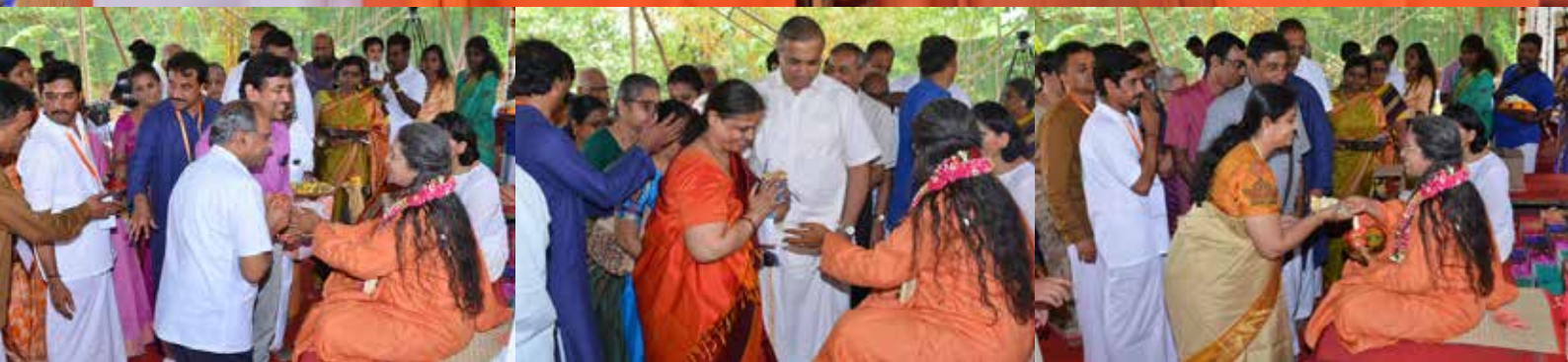
Blessings for one and all