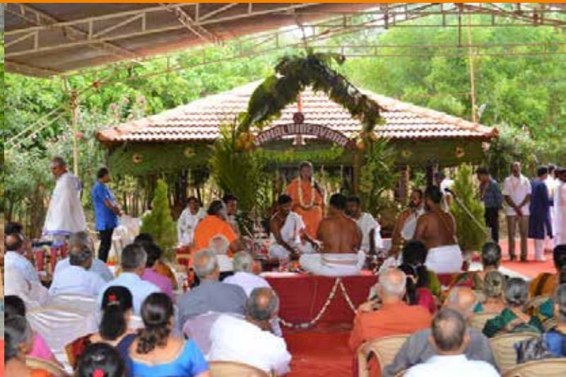
Ammaji in front of the temple