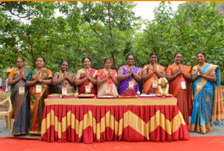
Bhagavadgita students of the Asrham for the Reception Team