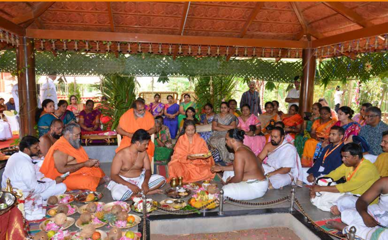
The ceremonies close after the Sambhavana of the priests