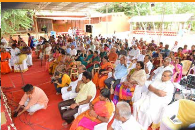
In rapt attention