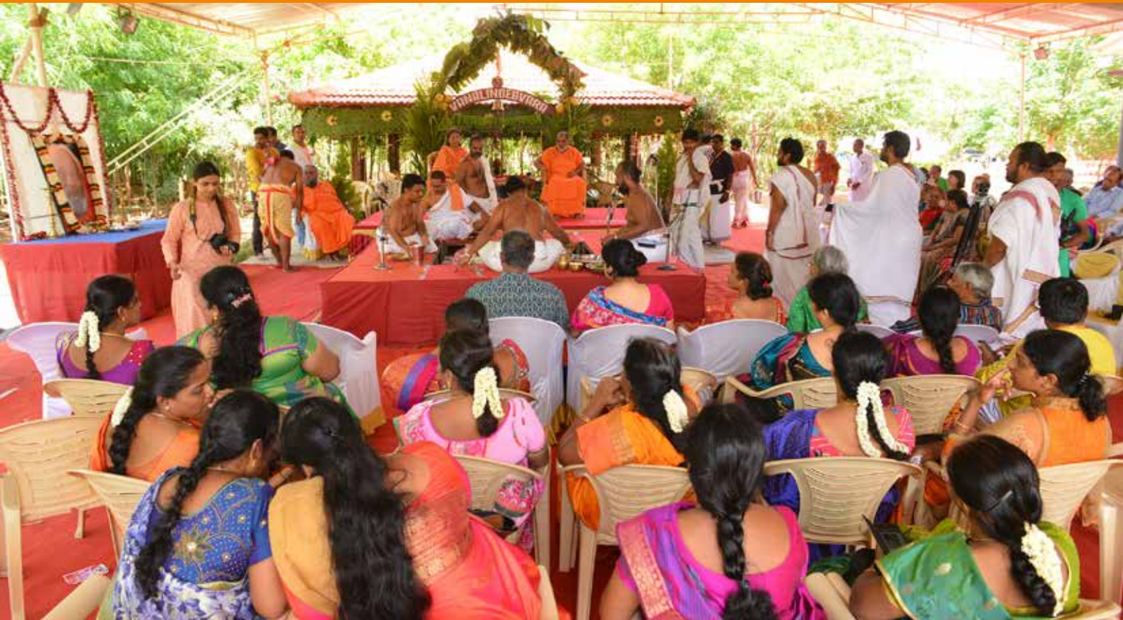
Everyone present is totally involved