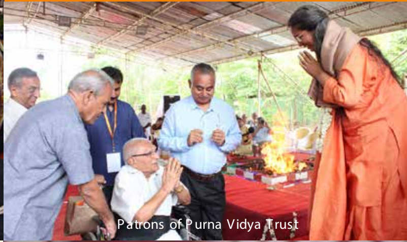
Patrons of Purna Vidya Trust