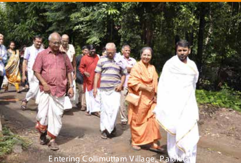
Entering Collimuttam Village, Palakkad