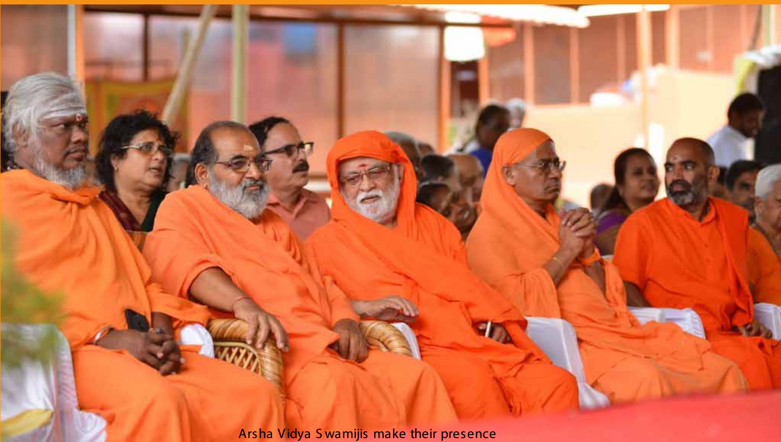
Arsha Vidya Swamijiis make their presence