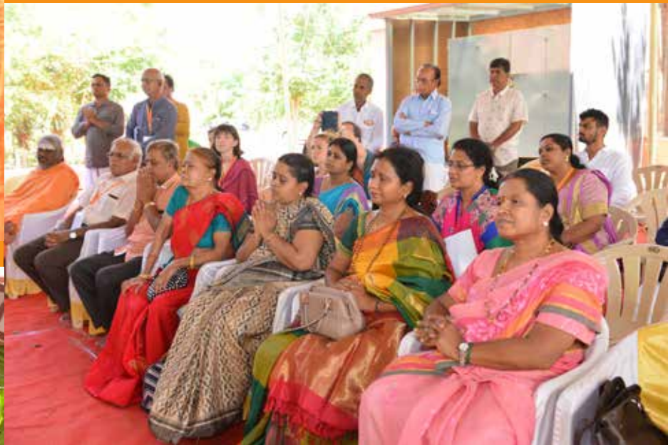
Students and disciples are partaking in the first day