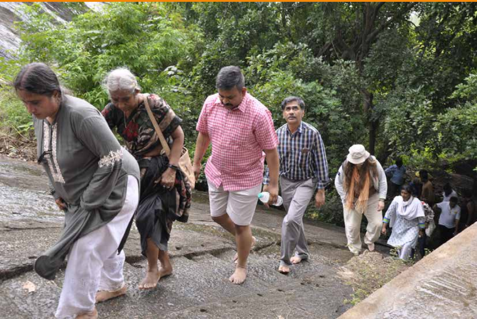
Entering SriRama temple in Koothadi Hills near ashram