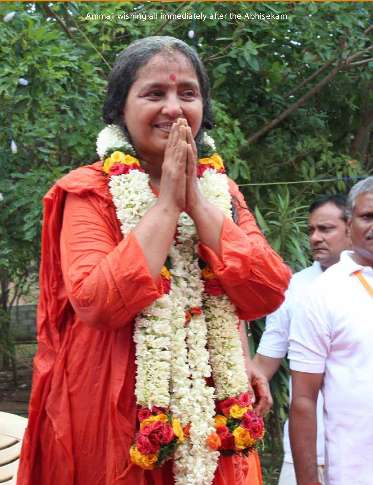
Ammaji wishing all immediately after the Abhisekam