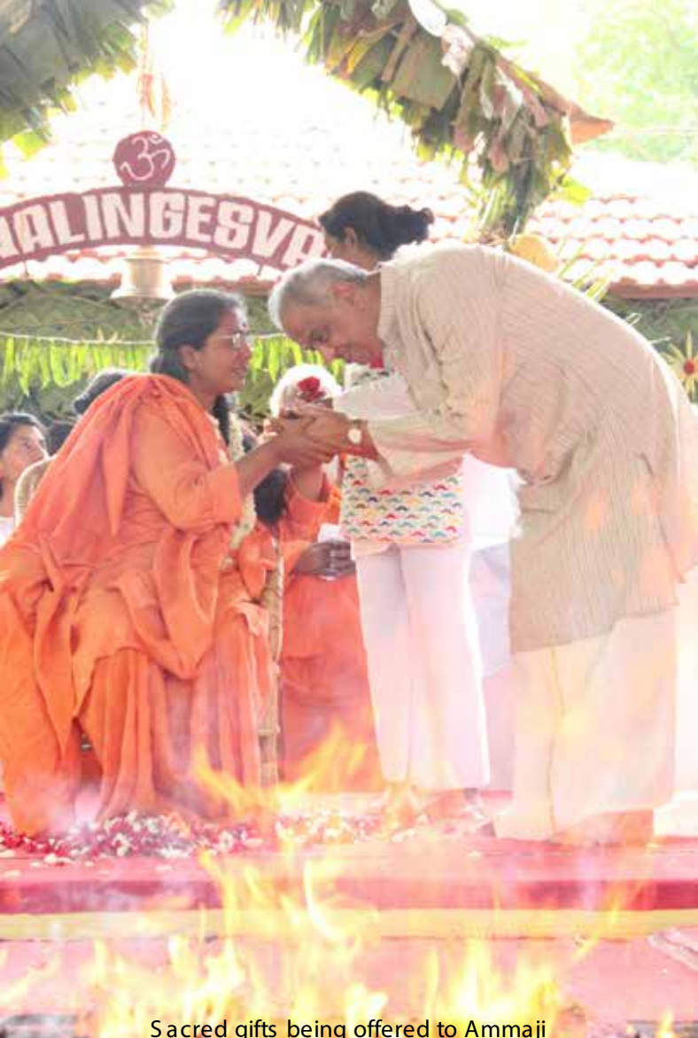
Sacred gifts being offered to Ammaji