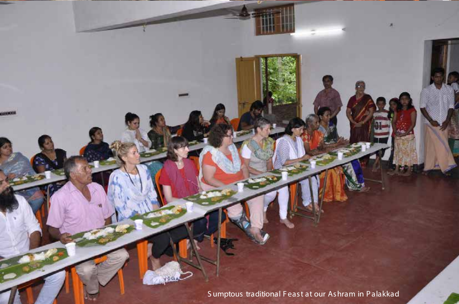
Sumptuous traditional Feast at our Ashram in Palakkad