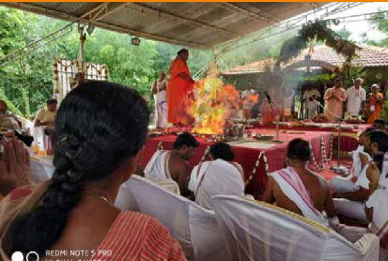
Offerings into the sacred fire