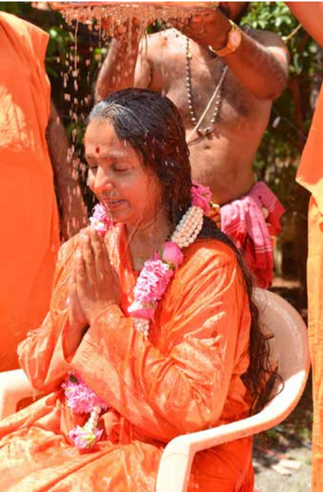
Maha-abhisekam of Ammaji on the first day