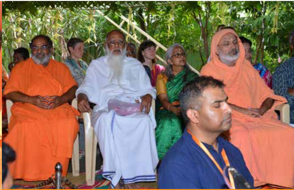
All are engrossed in the prayers and