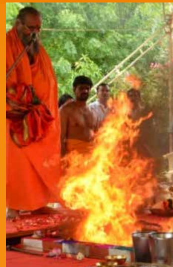
The sacred fire leaps up in the air