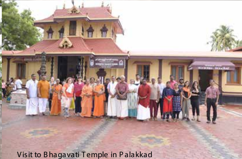
Visit to Bhagavati Temple in Palakkad