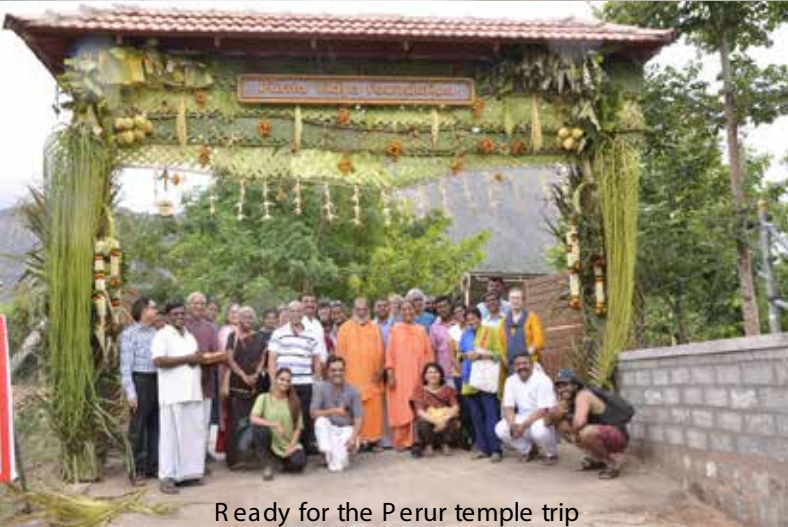
Ready for the Perur temple trip