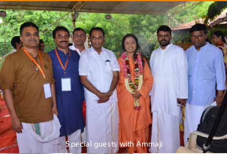
Special guests with Ammaji