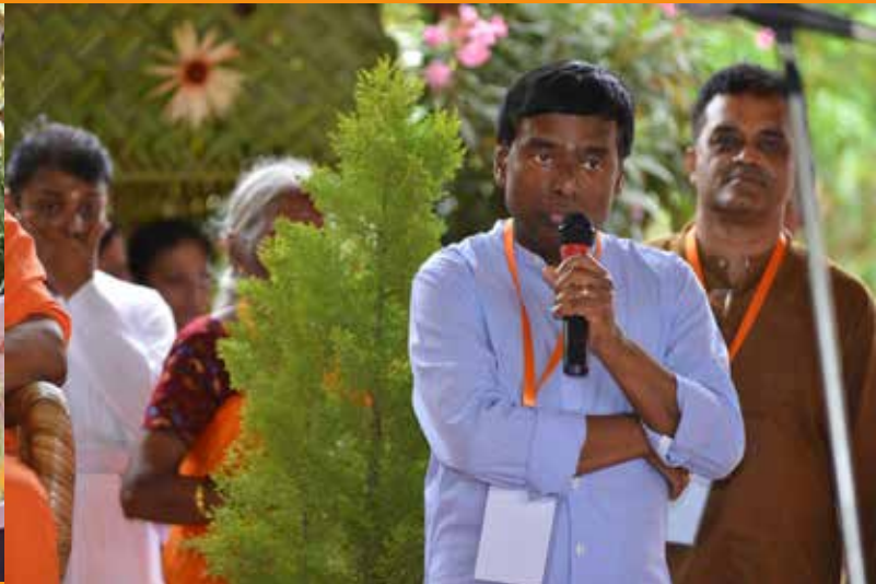
Purna Vidya U.K. speaks