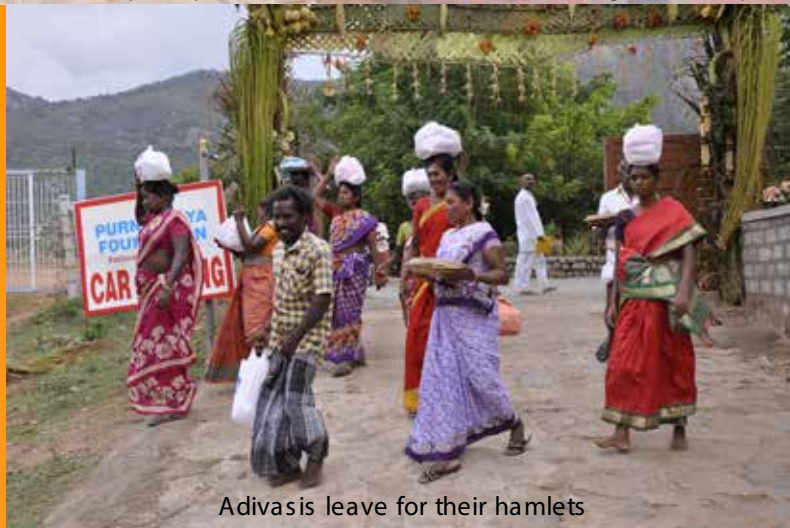
Adivasis leave for their hamlets