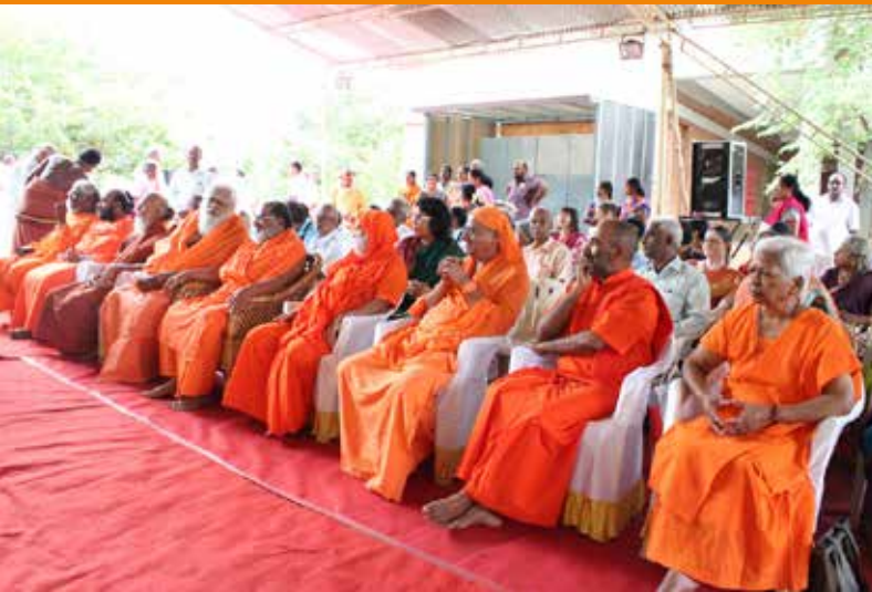
Presence of the sadhus during the function