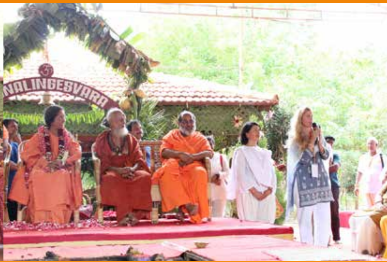
Purna Vidya Europe shares their gratitude to Ammaji