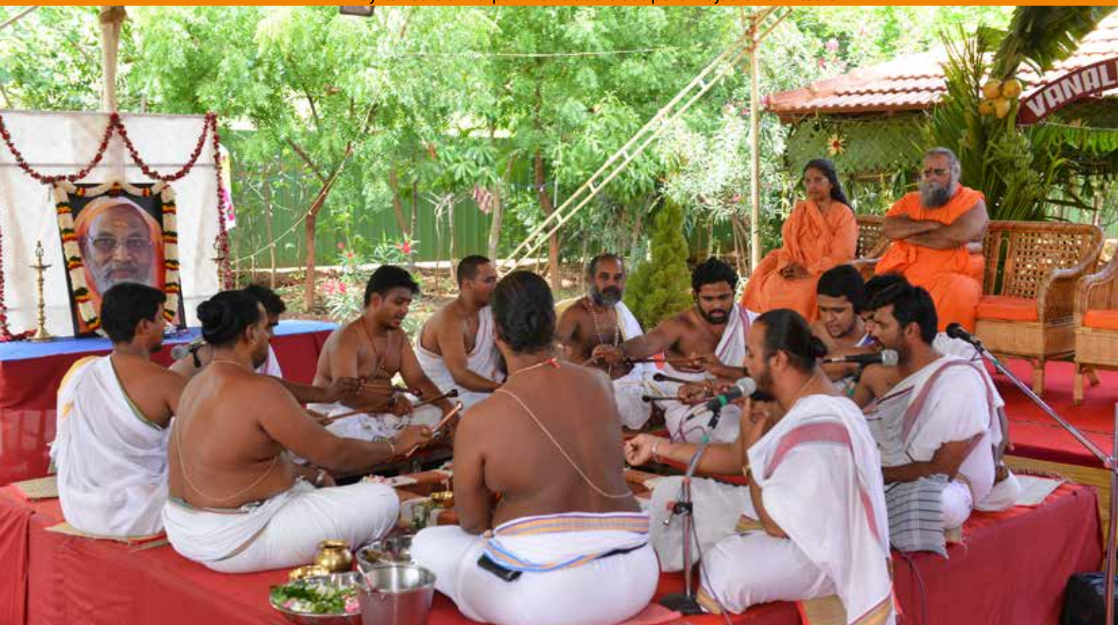
Homam is performed by the priests