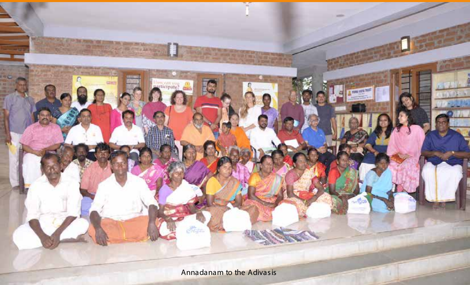
Annadanam to the Adivasis